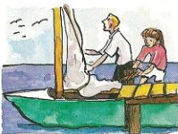
5. they/go sailing