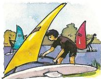
4. he/go windsurfing