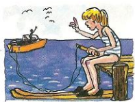
6. she/go water skiing