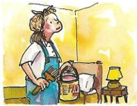
2. she/paint her room