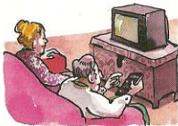
3. they/watch TV