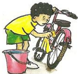
1. he/wash his bicycle